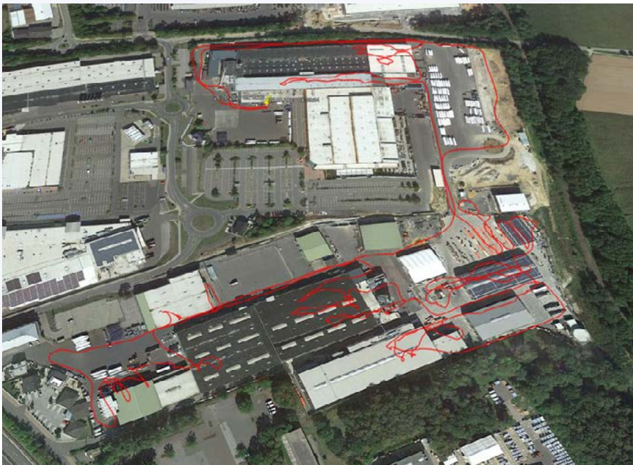
Example Outdoor Locator

With our Mobile / GPS module, you have the option of locating machines outdoors. We regularly record the position data and save it in the log book if required. With a simple click on the position data you can see the exact position e.g. display on Google Earth.