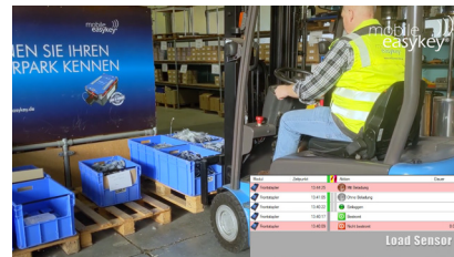
Sensor detects load: entry in the logbook